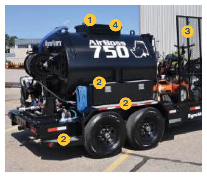
Equipment shown on the Storage Deck is not included.